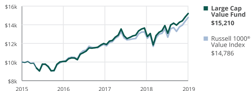
Chart indicates since inception performance.